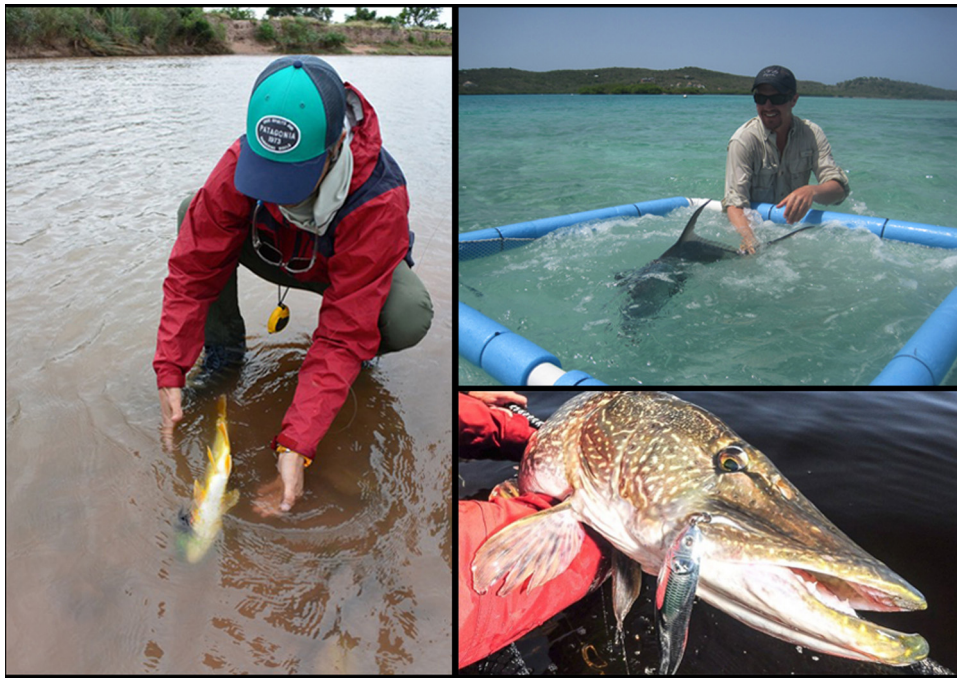
Fig. 4. Anglers testing reflex impairment using equilibrium (left; inverting fish to observe its ability to regain upright orientation) with a dorado, photo credit: Francisco Mariani, tail grab (top right; grabbing the tail to test for a swimming escape response) with a permit ( Trachinotus falcatus ), photo credit: Tyler Gagne, VOR (bottom right; Vestibular-Ocular Response; rolling the fish side to side watching for eye movement) with a northern pike ( Esox lucius ), photo credit: William Nalley.

damage from net abrasion, for example, is more minor than a hooking injury to the esophagus, and so while fish typically survive short term from these minor external injuries, longer-term fitness effects are substantially more challenging to quantify.