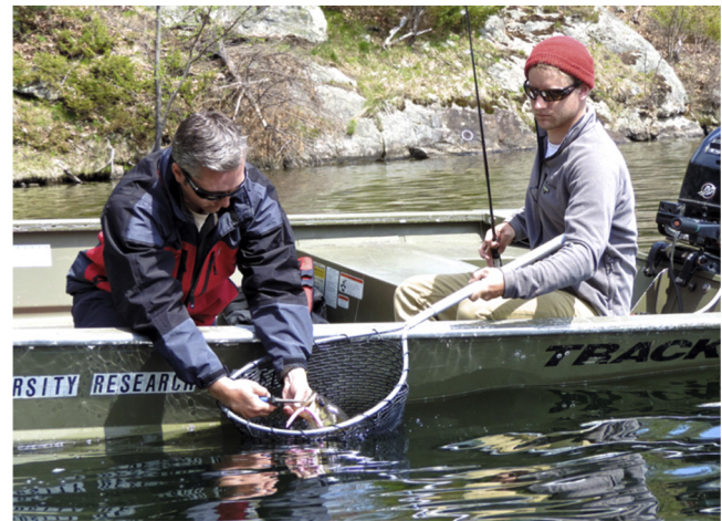
Fig. 2. Anglers using a rubberized landing net to hold a largemouth bass in water during the unhooking process.

While experimental evidence shows that longer retrieval durations increases physiological stress responses of angled fish, many studies using appropriate retrieval gear for the target species have found little correlation between retrieval time and fish condition. For example, while Gustaveson et al. (1991) showed in experimental simulations that longer angling times (up to 5 min) caused significantly greater physiological stress in largemouth bass ( Micropterus salmoides ), in real angling scenarios, Brownscombe et al. (2014c) found no association between physiological stress or reflex impairment with retrieval times or total fish fight intensity in this species using typical largemouth bass angling gear (medium strength rods and 7 kg break strength line). Other studies have had similar findings using typical gear for the target species in both freshwater and marine species (Landsman et al., 2011; Thorstad et al., 2003; Danylchuk et al., 2007; Danylchuk et al., 2011). Conversely, retrieval duration appears to be a more important