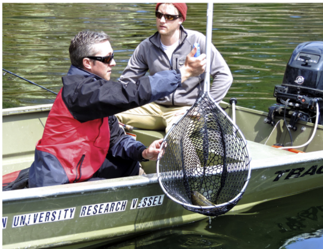
Fig. 3. Anglers using a landing net to weigh a fish, minimizing weighing injury and stress.

2014). As research continues to develop species-specific length-weight ratios, anglers can still attain estimates of the weight of their fish without actually weighing it. However, one conservation-minded method of weighing fish is using a landing net or similar vessel (Fig. 3). Anglers can weigh fish within landing nets by gripping the top of the net instead of the fish, and simply tare the scale to the weight of the net to get actual fish weight. Using this method, physical damage related to the weighing process can be reduced to that of net abrasion, which is already present if the fish is landed and retained in such a vessel. Further, the chance of fish falling onto abrasive surfaces is minimized, as is the potential for air exposure.