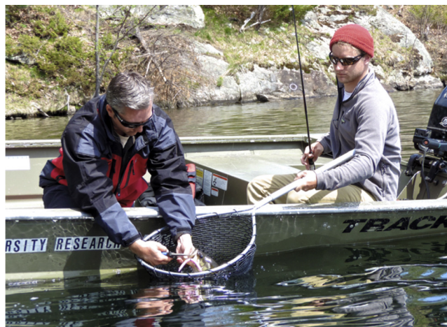
Fig. 2. Anglers using a rubberized landing net to hold a largemouth bass in water during the unhooking process.

While experimental evidence shows that longer retrieval durations increases physiological stress responses of angled fish, many studies using appropriate retrieval gear for the target species have found little correlation between retrieval time and fish condition. For example, while Gustavson et al. (1991) showed in experimental simulations that longer angling times (up to 5 min) caused significantly greater physiological stress in largemouth bass ( Micropterus salmoides ), in real angling scenarios, Brownscombe et al. (2014c) found no association between physiological stress or reflex impairment with retrieval times or total fish fight intensity in this species using typical largemouth bass angling gear (medium strength rods and 7 kg break strength line). Other studies have had similar findings using typical gear for the target species in both freshwater and marine species (Landsman et al., 2011; Thorstad et al., 2003; Danylchuk et al., 2007; Danylchuk et al., 2011). Conversely, retrieval duration appears to be a more important